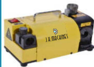
DRILL BIT GRINDER (Pg. No. 18)