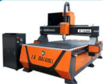
CNC WOOD ROUTER (Pg. No. 17)