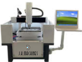
CNC ENGRAVING (Pg. No. 16)