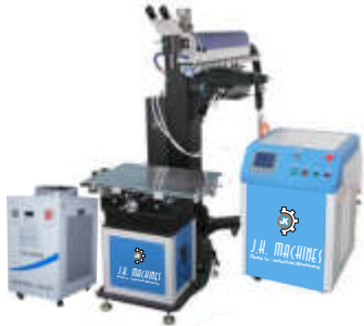
LASER WELDING (Pg. No. 11)