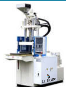
VERTICAL MOULDING (Pg. No. 21)