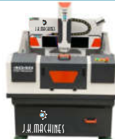
CNC ENGRAVING (Pg. No. 15)