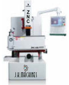
ZNC EDM AC SERVO (Pg. No. 06)