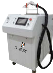
HAND HELD LASER (Pg. No. 12)