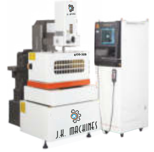
CNC WIRE CUT AC SERVO (Pg. No. 10)